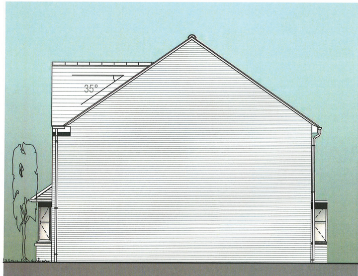
RIGHT GABLE ELEVATION